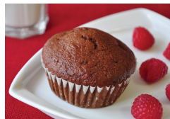
Choc. Chip Muffin